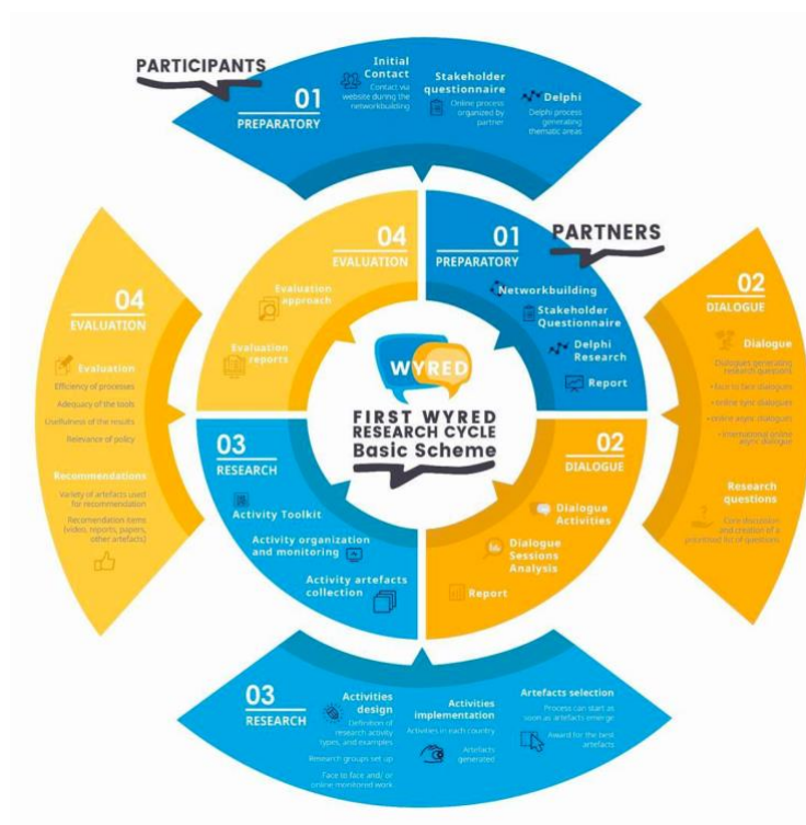
Figure 1: 1 st Cycle of the WYRED Project (WYRED Consortium, 2017)