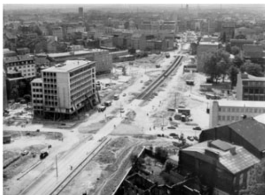
Figure 21. The corner of Berliner Allee and Steinstraße in the late 1950s

Actually, this part of the DM proposes some other considerations connected to traffic problems and pollution that bring far away from the context of the destructions caused by the war. Answering both the two questions “What problems can arise because of high volume of traffic and a densely built-up area?” and “What measures can be taken (by the state and the city) to reduce pollution?” demands a good linguistic level as far as it is no more matter to describe something but to argue an issue.