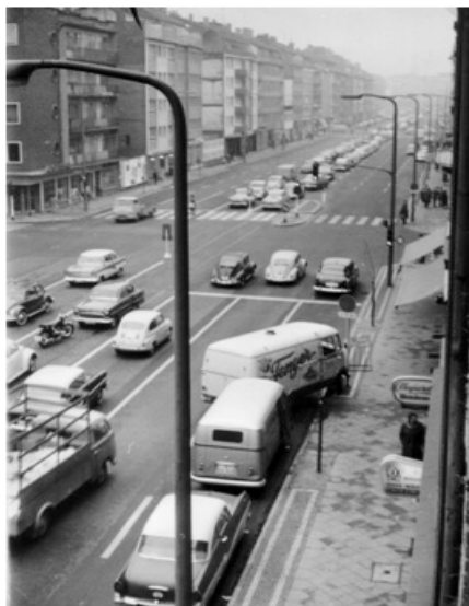
Figure 22. Corneliusstraße before the introduction of trams