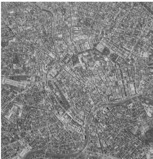
Figure 20. Wien map 2