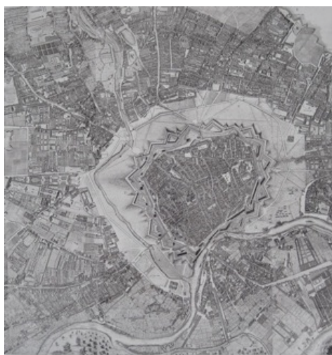
Figure 19. Wien map 1

This approach implies a linguistic design with some links with other curricular areas. The focus is definitely on the language more than on the contents. If we choose, for example, the Digital Module Vienna – Population Dynamics and Urban Expansion in the 19th Century ( http://grial4.usal.es/MIH/vienna/ ), that deals with the urban development of Wien, targeted to pupils attending Lower Secondary School, we find two pictures depicting the town, the first one, at the end of the XIX century and the second one nowadays (Figure 19 y Figure 20). A short presentation explains the differences between the two maps.