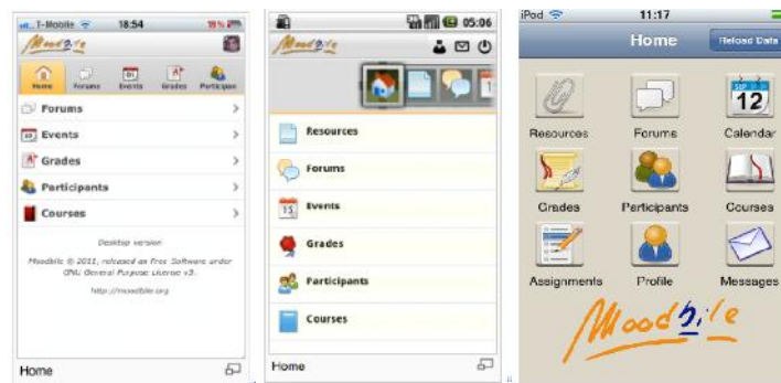
Figure 2: Moodbile client apps: Html5, Android and iOS Clients.

Three mobile clients have been developed to test Moodbile architecture and services, and to conduct research in m-Learning topics. These client's interface are shown in Figure 2.