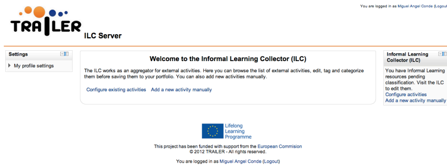
Fig 2. ILC competences configuration tool