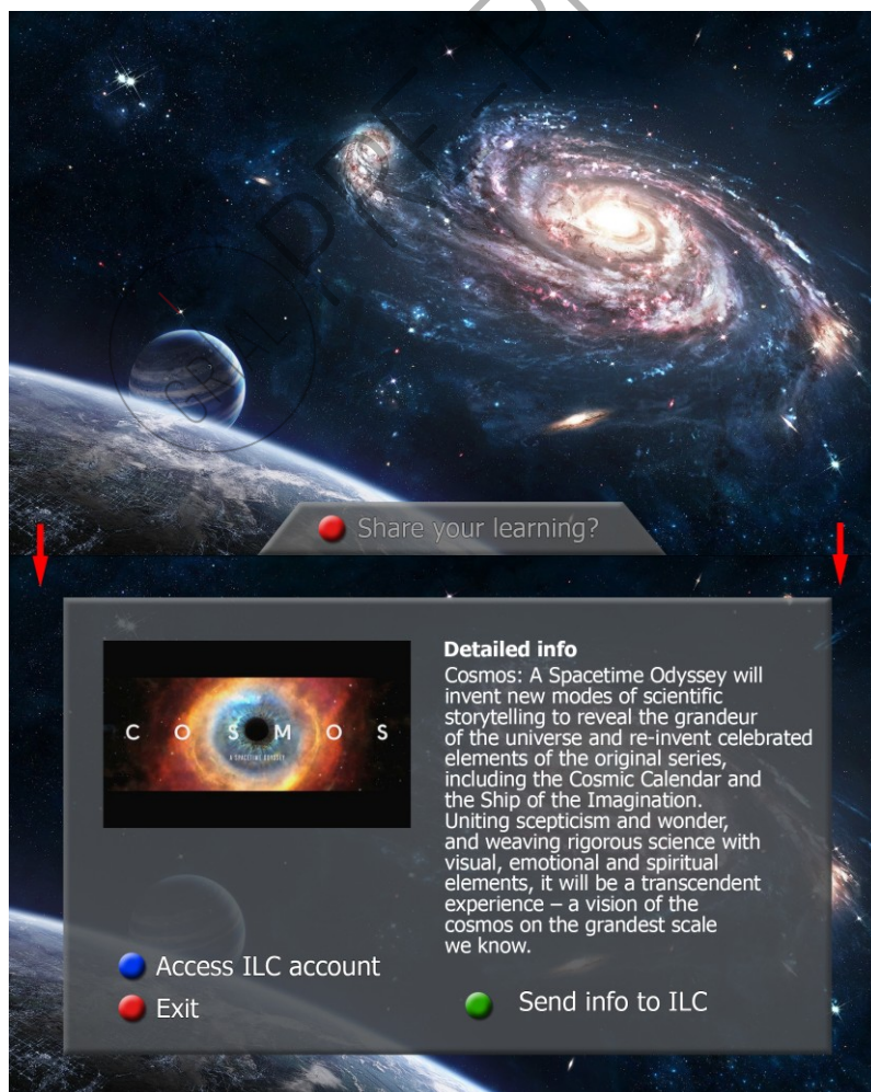
Figure 2. User interface of the application for sending ILA to ILC

The development of the application requires following a standard set by the community gathered around interactive television broadcasting such as HbbTV [16]. The standard provides the ability of making a specific type of broadcast-related auto-start applications. The user interface provides the user with the information that an app can be started using the remote (typically press of the remote red button as seen in top of Figure 2). In our case this app opens a specific dialogue that enables the user to send information on what program he is currently watching to the ILC (bottom of the Figure 2). It is important to note, that this type of applications is dependent of the broadcaster, so a specific broadcaster would have to include it in the offered package for viewers to be able to use the service.