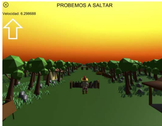
Fig. 8. Main game screen of Fisio Run game. The player must jump or crouch to avoid the obstacles by moving the selected extremities.

Reflect stage. The collaboration between the University and APCA is close and easy. However, we must go further to develop other projects. Moreover, the Kinect device should be complemented with other interaction devices. Therefore, the next improvement plan has as main objectives: