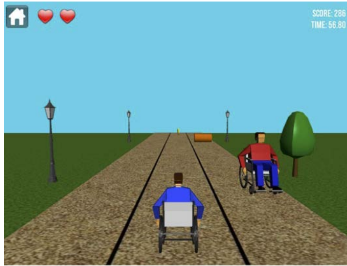
Fig. 6. Main game screen of Formula Chair game. The player must change the lane to avoid obstacles and people and collect coins by moving the selected extremity.

therapists and the users. Therapists responded to three questions on a Likert scale with values between 1 (strongly disagree) and 5 (strongly agree), in addition to providing their personal opinion. An open question was also set out. These questions try to explore the possibility of using video games to complement the work of physiotherapists. Since only two therapists participated, the results are not statistically significant but they allow us to propose improvements for the next iteration. Table 1 shows the questions and answers obtained.