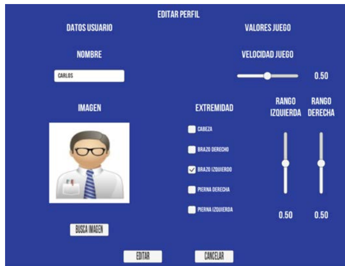
Fig. 5. Interaction configuration screen of Formula Chair game. The profile allows the selection of the extremity and the movement ranges.

During the realization of the project, we detected some aspects to be redefined: for example, it was necessary to implement a pause function. The game is paused at the beginning, until the user is ready to start, and there is also an automatic pause if the Kinect device loses the user's reference. Figure 5 shows a screenshot of the interaction configuration screen and Figure 6 the main screen of the game.