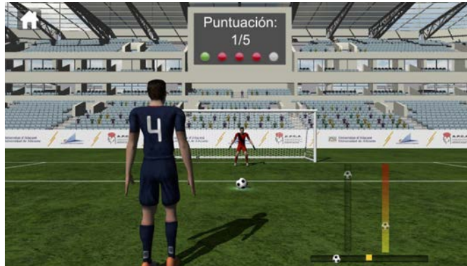
Fig. 3. Main game screen of Footb-all game. The sliders to select the horizontal and vertical direction and the speed are placed on the right bottom corner of the screen.