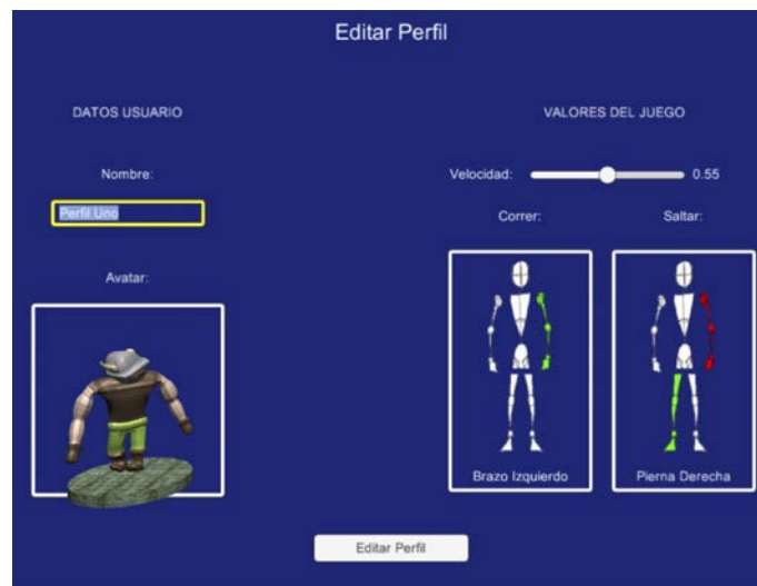
Fig. 7. Interaction configuration screen of Fisis Run game. The profile allows the selection of the extremities for each movement.

Figures 7 and 8 show the configuration and the game screens.